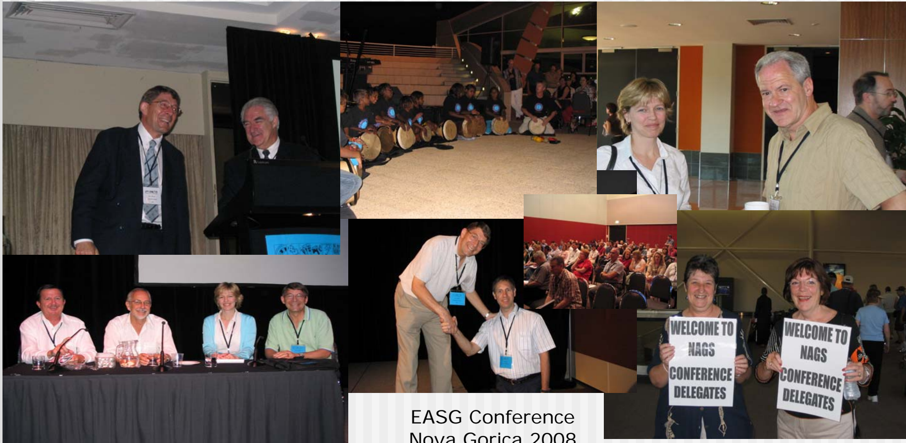
EASG Conference Nova Gorica 2008